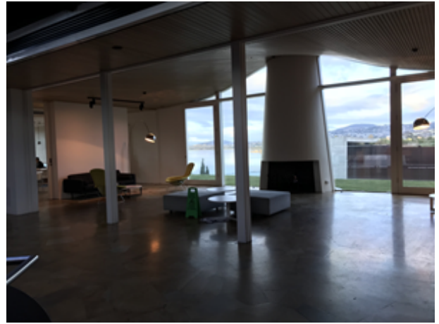
Sitting Room, Courtyard House DPIPWE