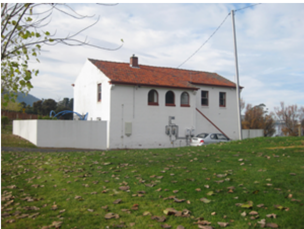
Farmhouse (Gatehouse) DPIPWE