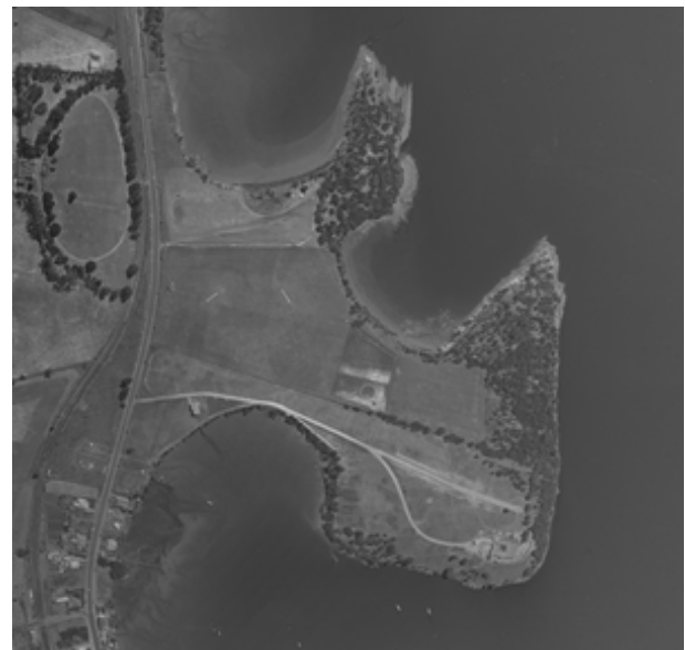
Moorilla Estate, 1957 LTO 0327/023