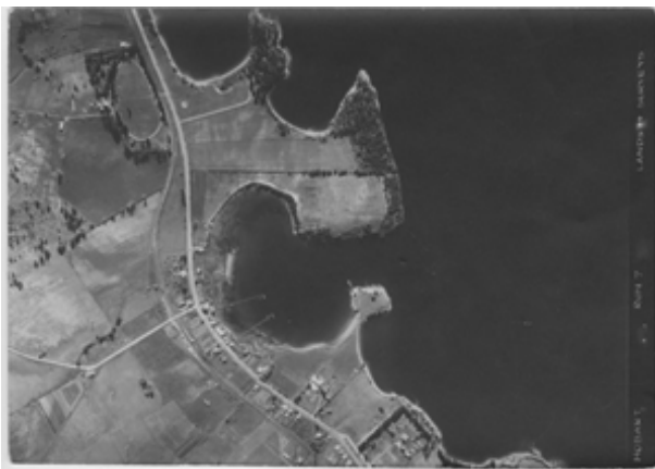
Large Fry Pan Peninsula 1946 LTO 14235

Title References Property Id 164039/1 2250425 61366/4 2250425 61366/3 2250425