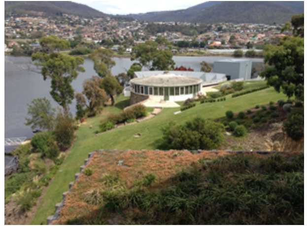
Round House prior to construction of Pharos DPIPWE