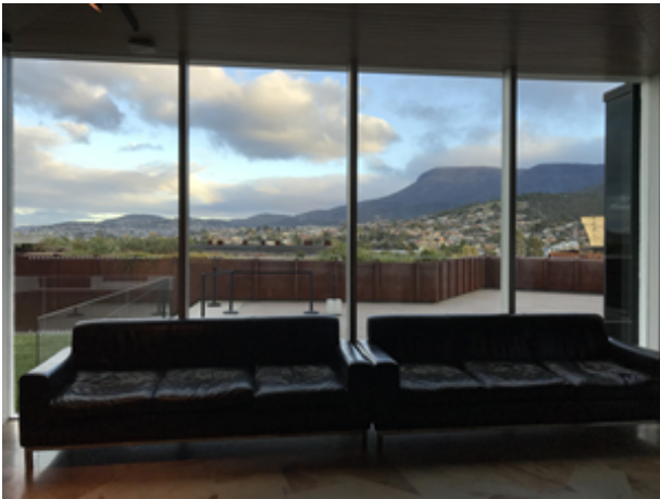
Views from Courtyard House windows DPIPWE