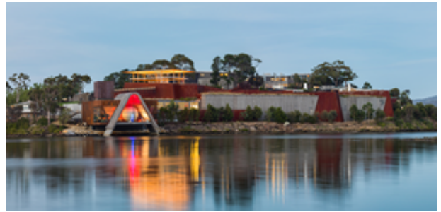
View of the Museum of Old and New Art from Small F MONA