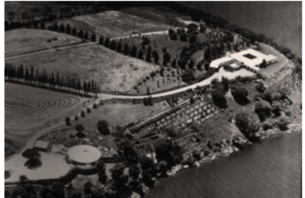
Moorilla Estate c1960s MONA