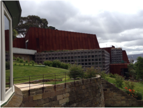
Exterior of MONA, prior to construction of Pharos DPIPWE