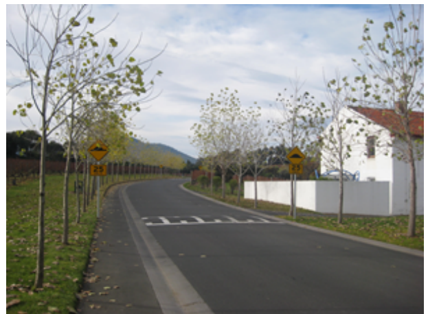
Poplar Avenue and Farmhouse (Gatehouse)