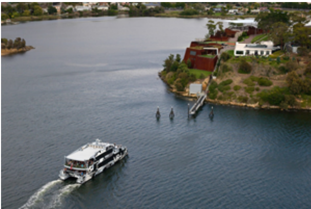
View of Courtyard House and river side entrance MONA