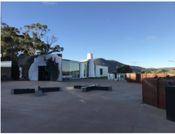
MONA forecourt and entrance to Courtyard House DPIPWE